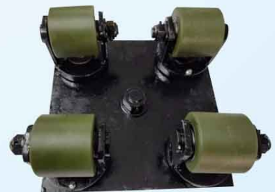
SKID TYPE CASTOR