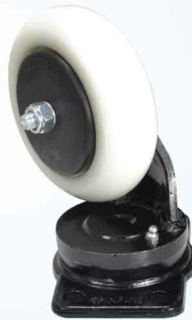
SINGLE ARM SWIVEL