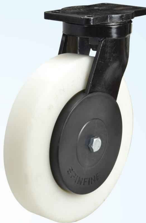
Batch Trolley Wheel (SFB2)