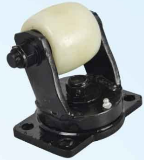
HEAVY DUTY LOW HEIGHT CASTOR WHEEL