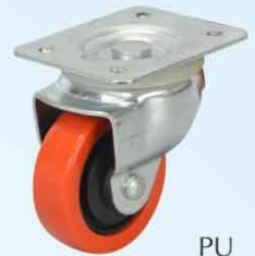
PU PU (T3SP 80 mm)