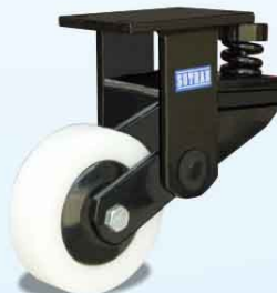
Spinline Fixed Castor with "Shock Absorber"