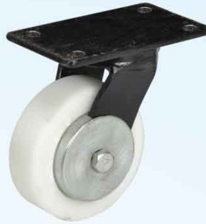
100 X 32 WINDING AND DOFFING TROLLEY