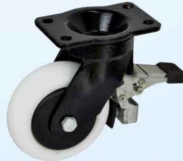
SFC Swivel (Brake)