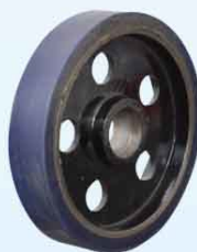
PU on CI