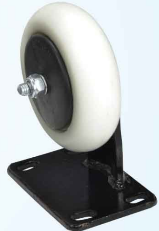
SINGLE ARM FIXED