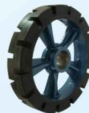
RBCI Rib Type