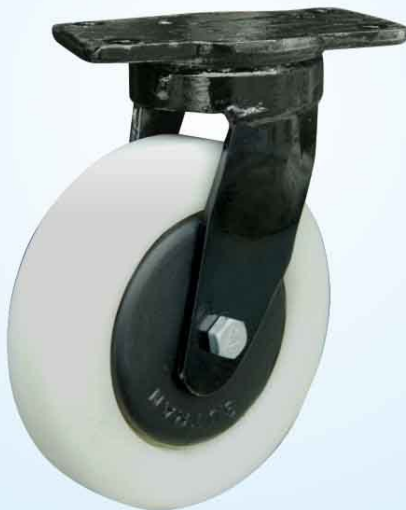
with Thrust Bearing