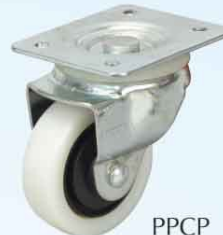
PPCP PPCP (T3SP 80 mm)