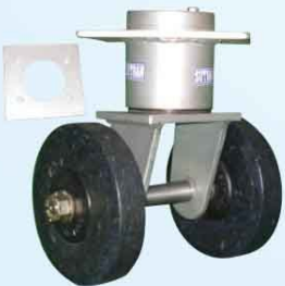
Dual Wheel on Taper Roller Bearing Construction