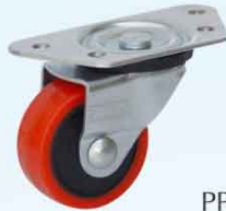
PPR PPCP "Red" (T2TRP 60 mm)