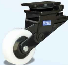
Spinline Swivel Castor with "Shock Absorber"