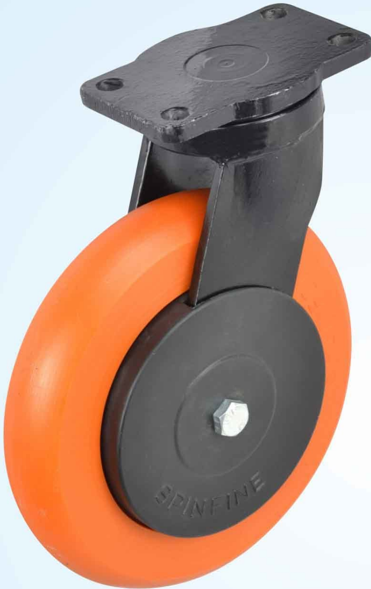
SFB2 with ETG