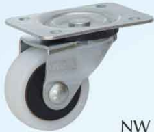
NW Nylon White (T2 60 mm)