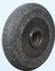
UHM on CI