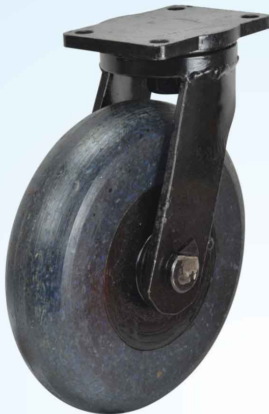
A Frame Trolley Wheel (SFB3)